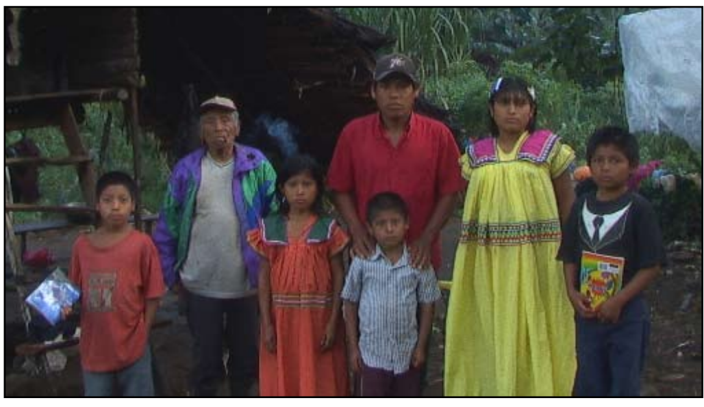
Ngöbe family in Bajo Colubre