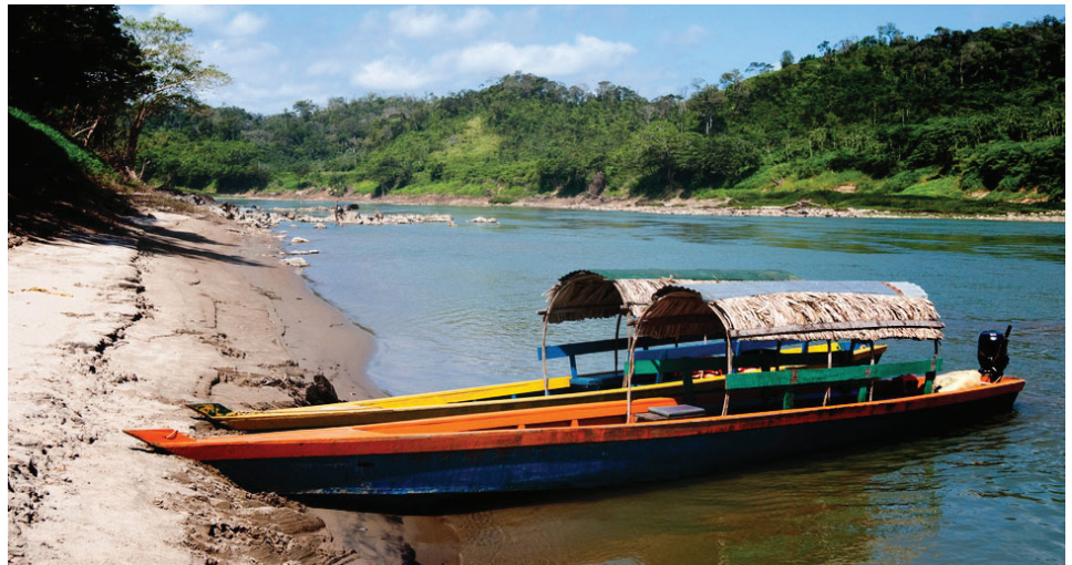
Boats on the Usumacinta river